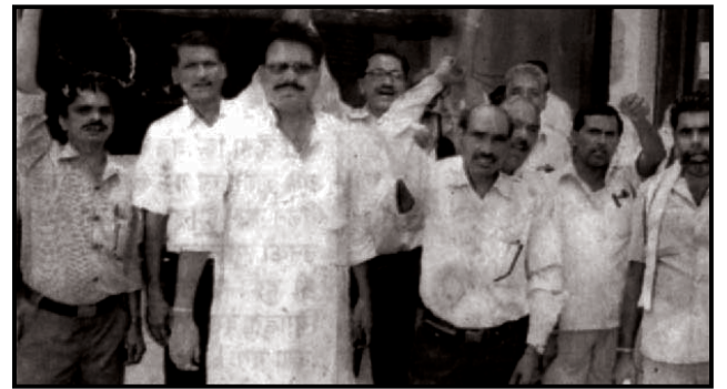
प्रदर्शन करते दूरसंचार कर्मचारी।