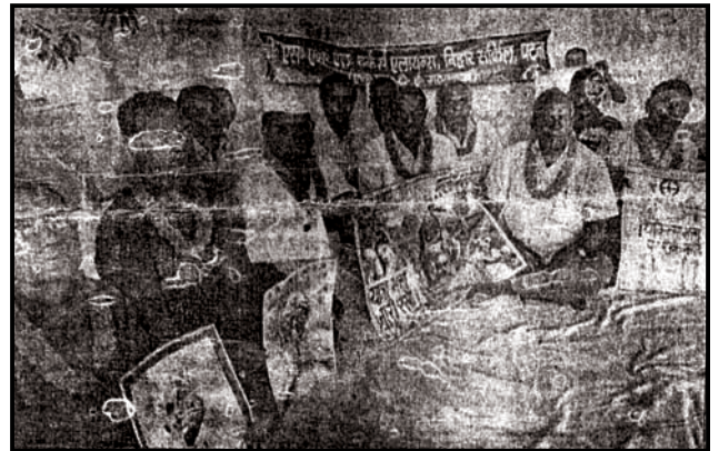
13 सितम्बर 2011 संचार सदन परिसर, पटना में धरना देते बीएसएनएल के कर्मचारी

संघ ने आग्रह किया कि इस प्रकार के औपचारिक बैठक की व्यवस्था नीचे स्तरों पर भी होनी चाहिए। संघों से संवाद के अभाव में कम्पनी प्रगति नहीं कर सकती।