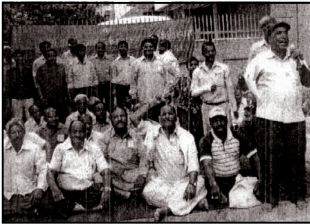
बीएसएनएल कार्यालय में प्रदर्शन करते कर्मचारी।

इलाहाबाद, 13 सितम्बर। एलटीसी एवं एमआरएस बन्द होने से नाराज दूरसंचार कर्मियों का गुस्सा सातवें आसमान पर बढ़ गया है। नाराज दूरसंचार कर्मियों ने आज महाप्रबंधक दूरसंचार कार्यालय के सामने अपनी मांगों को तत्काल निस्तारण के लिए प्रबंधन, नई दिल्ली के खिलाफ विशाल