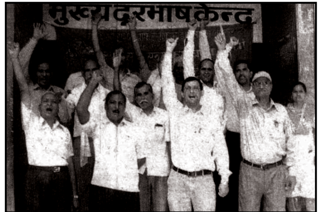
बीएसएनएल कार्यालय पर नारा लगाते कर्मचारी