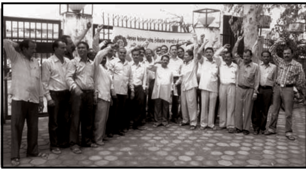
विदिशा में कर्मचारी प्रदर्शन करते हुए