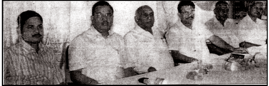
अयोध्या टैक्स भवन में बुधवार को नेशनल फंडेशन ऑफ टेलीकॉम एम्प्लॉइज का खुला अधिवेशन हुआ।