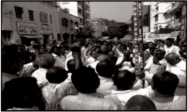
Com. Islam, President hoisting the National flag