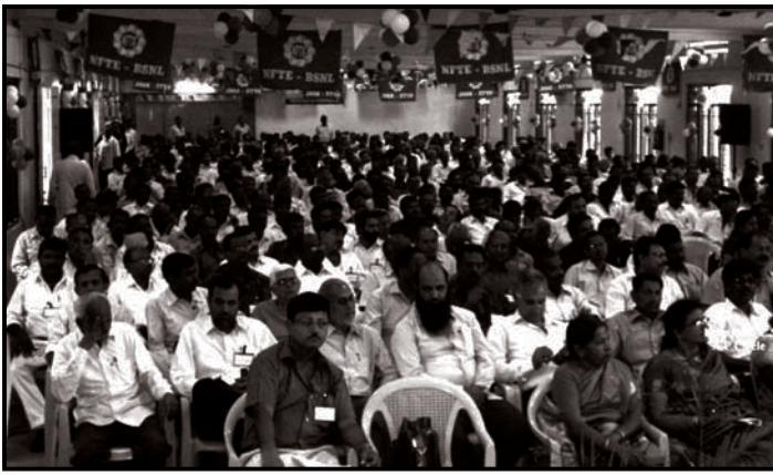
A view of audience