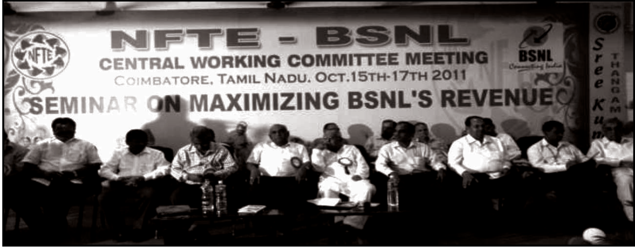
A view of Dias